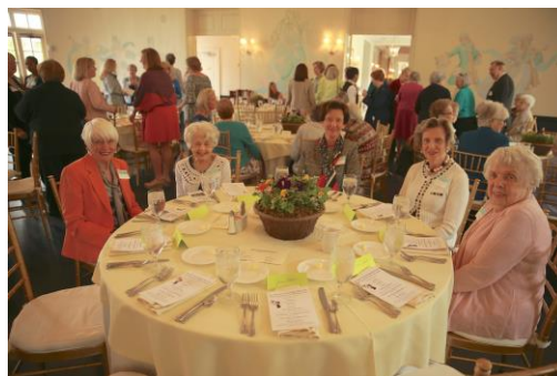
Guild Members gathering for the Luncheon