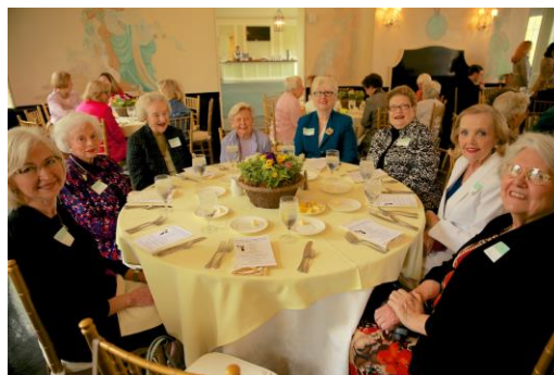
All smiles as we wait for the Scholarship Winners to Perform!